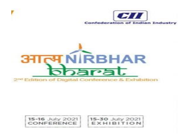
For more information