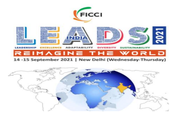
For more information